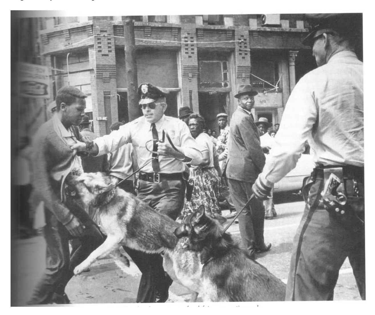
Source B "Children's crusade" organized by SCLC Birmingham, Alabama, May 3, 1963